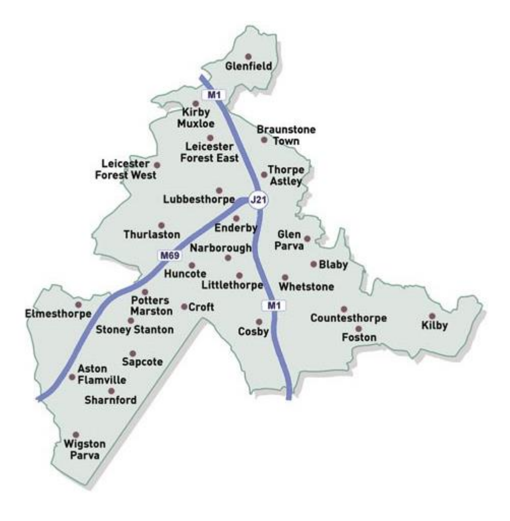
Figure 1: Map of Blaby District